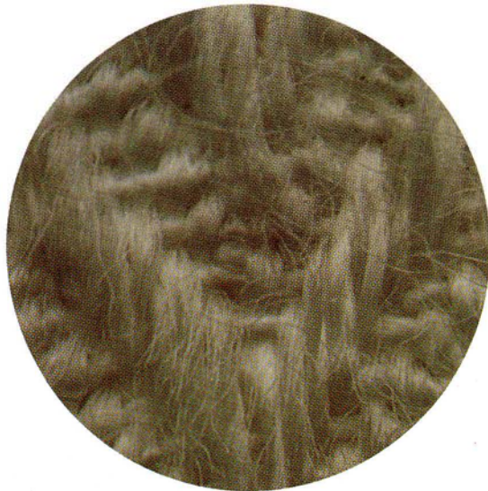
Washed in tap water

These pictures show how much detergent residue your hard water can't rinse out. This residue dries on fabrics making them dull, brittle and reduces the effectiveness of flame resistant fabrics.