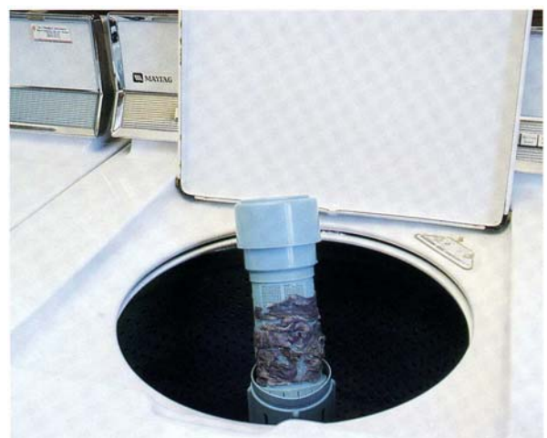
The washer lint trap catches bits of fabric weakened by the washing cycle and deposits of hard water impurities.

Maytag, GE, Whirlpool, Speed Queen, Hot Point and Kitchen Aid recommend soft water as a means to help their washers perform better and last longer.