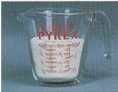
Amount of detergent with hard water

By following recommended usage amounts, you can see how much AAA BestWater can save you on laundry detergent alone! Better yet use a pure biodegradable soap concentrate.