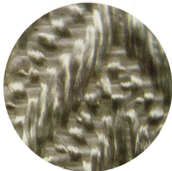
Washed in Soft water