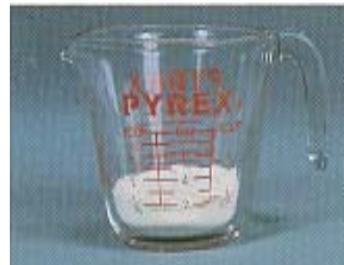
Amount of detergent with AAA BestWater soft water