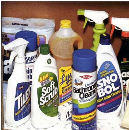
In the bathroom