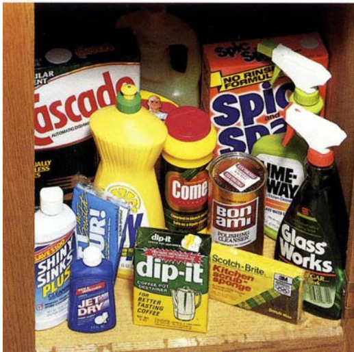
In the kitchen

☑ You will be able to reduce or eliminate many of these cleaning products when you, clean, wash and launder with AAA BestWater .