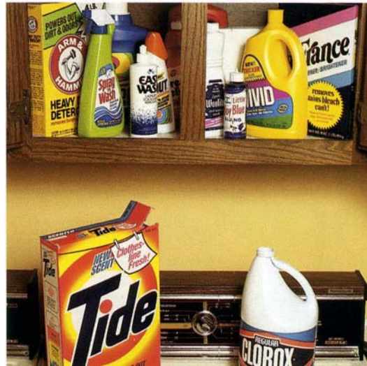
In the laundry