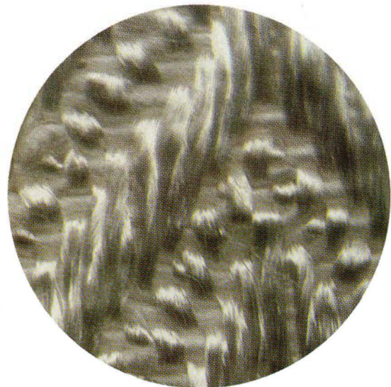
Washed in Soft water